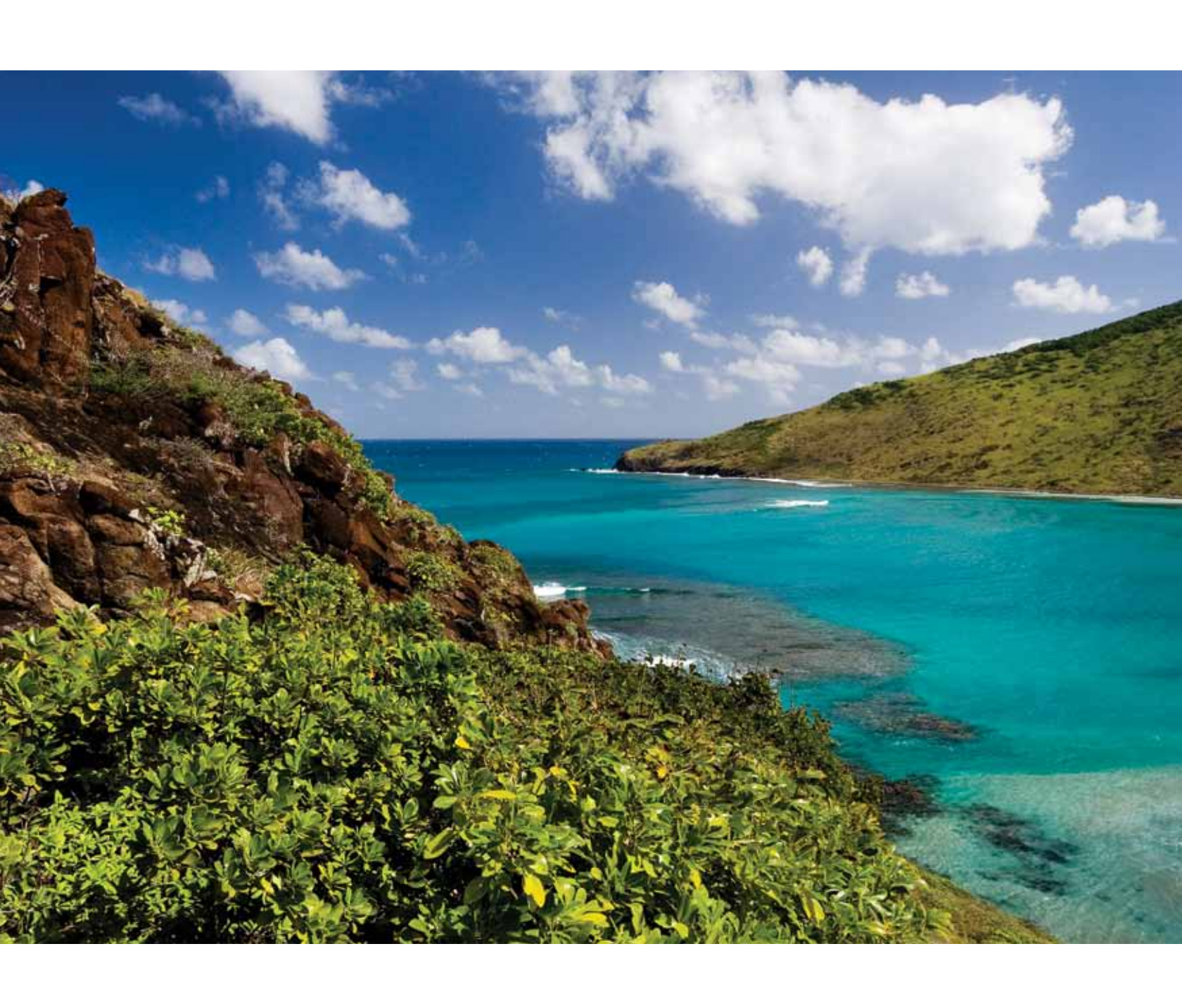
FOR MORE INFORMATION, PLEASE CONTACT CHRISTOPHE HARBOUR REAL ESTATE:

869.466.8738 or 800.881.7180 | info@ChristopheHarbour.com | ChristopheHarbour.com