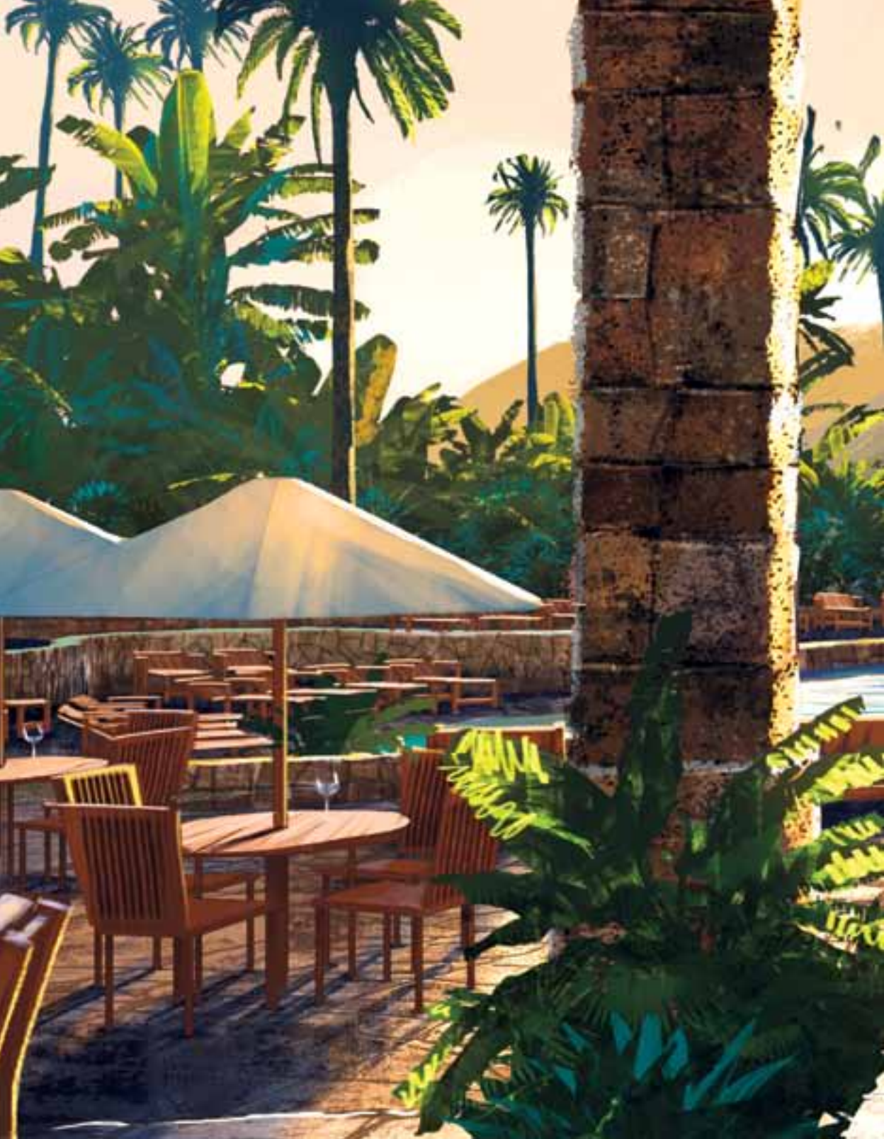
View toward the beach from the open air dining in the new Sandy Bank Bay Beach Club. Coral stone columns frame elevated views out to the pool garden and bay.