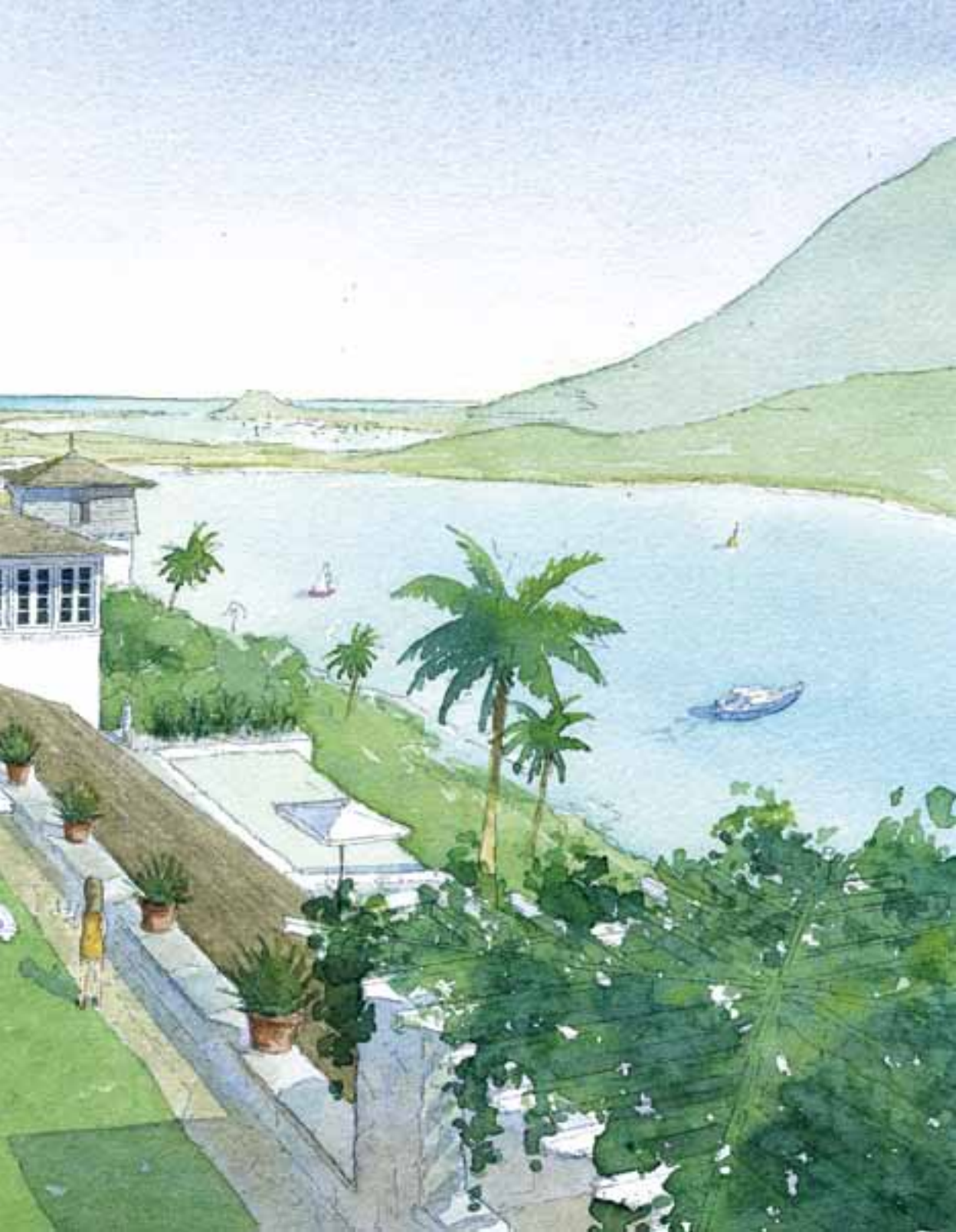
View from an upper guest house terrace, looking south toward Sandy Bank Bay Beach Club, with the beach and mega-yacht harbour in the distance.